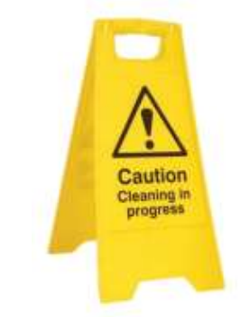
CAUTION BOARD Features: Double Sided, Easy to Move Size: 30 x 60cm