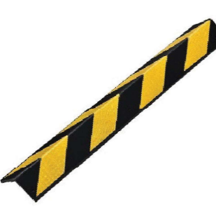
L CORNER GUARD Manufactured from flexible and high strength rubber. Tamper resistant. 100 x 10 x 1cm