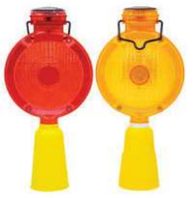
SOLAR FLASHING CONE LIGHT Monocrystalline solar panel Super brigh LED Color: Yellow & Red