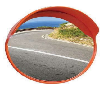
CONVEX MIRROR Easy to install. Attachable on wall or pole. Sizes: 100cm