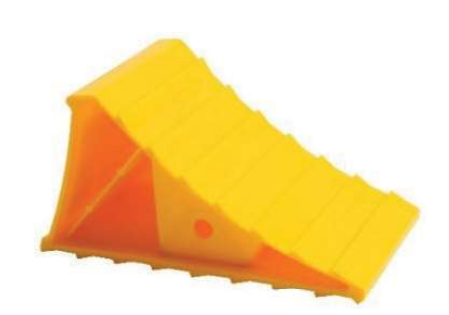
WHEEL CHOCK Material: PVC Color: Yellow Size: 20 x 11.5 x 11cm