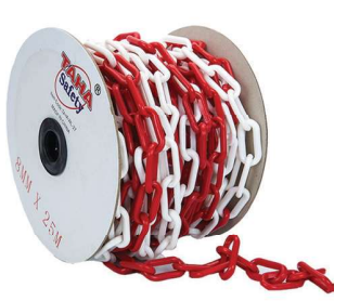
TAHA WL WL 27 WARNING CHAIN Plastic. PE material. Diameter: 8mm In-length: 38mm Out-width 26mm 85g, 25m/roll, Colour: Red White