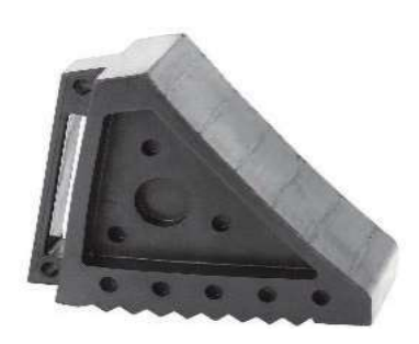
WHEEL CHOCK 2kg Light weight yet durable enough to keep any vehicle or trailer in place. Size: 21 x 15x 10.5cm