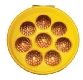
SUNFLOWER WARNING LIGHT 8 Ultra-LED LED Color: Yellow Size: 37 x 7 x 37cm