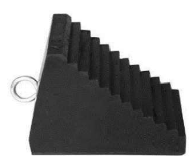
WHEEL CHOCK 4KG Hook Type 24 x 16.5 x 19cm

CORNER GUARD WITH METAL PLATE Material: Rubber and Metal Color: Yellow/Black 100 x 7.5 x 1cm