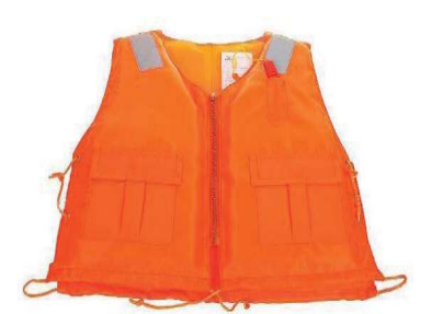
JACKET WITH WHISTLE High visibility jacket with a whistle. Size: Free size