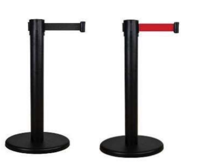
FULL BLACK QUEUE BARRIERRed Belt 2MSize: 90 X 32cmBlack Belt 2MSize: 90 X 32cmMaterial: S.S.Weight: 5kgs

T-TOP BOLLARD Material: PE Reflective: 150mm Weight: 6 K.G Size: 110 x 10cm