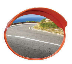
CONVEX MIRROR Easy to install. Attachable on wall or pole. Sizes: 80cm