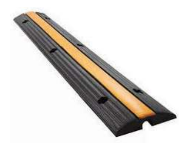
1 CHANNEL CABLE PROTECTOR SMALL Channel Size: W 30mm x H 15mm Size: 100 x 15 x 3cm

PARKING WHEEL STOPPER Black color with yellow bead strip Superior strength Easy to install Size: 55 x 15 x 10cm