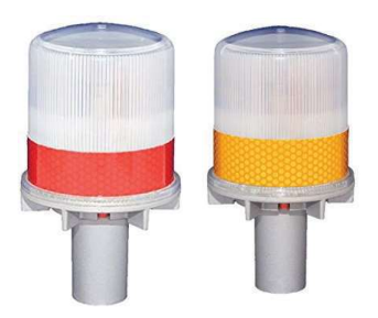
WARNING LIGHT Solar Powered Flashing Light Color: Yellow & Red