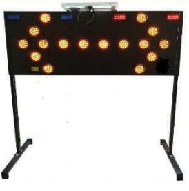
RIGHT LEFT SOLAR LED LIGHT Material: Aluminium LED Color: Yellow Size: 120 x 4 x 40cm