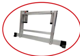
Stabalizer provided for 16+16 and more steps