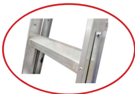
Ribbed Anti slip Rungs