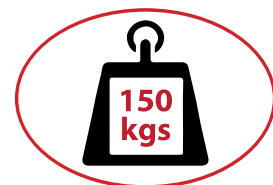
Tested at 150 kgs