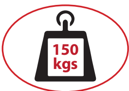
Tested at 150 kgs