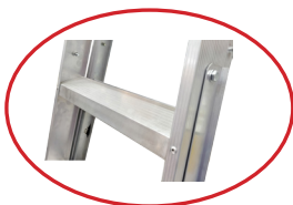
Ribbed Anti slip Rungs