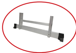
Stabalizer provided on demand